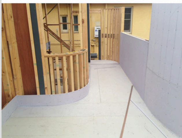
High quality Polyurethane Systems supplied to Multipanel by Pacific Urethane .