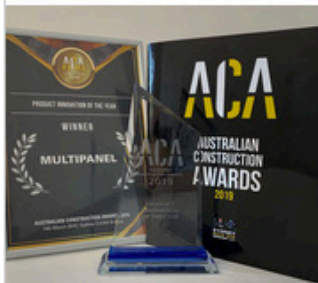
A strategic partner of Pacific Urethanes wins industry award